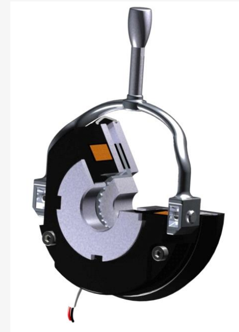
„Power-Off“ Spring-Applied Fail-Safe Brake