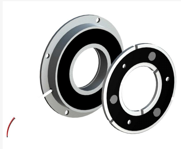
„Power-On“ Brake Single-Disc